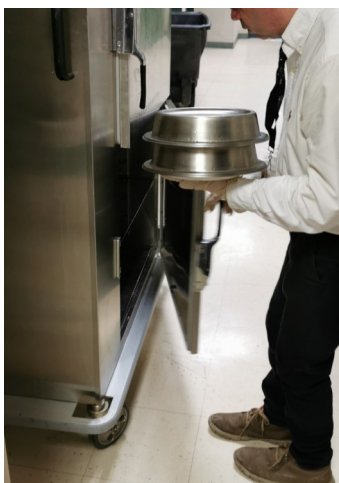
A volunteer puts plates in the heated cupboards that will be brought at the Residence.

However, the adjustment of operations had to be done while continuing the other services. Indeed, there is more than just a senior's Residence at 550 René-Lévesque blvd. It is also the location of the Shelter which houses 194 homeless men every night, as well as 34 people in a social reintegration program.